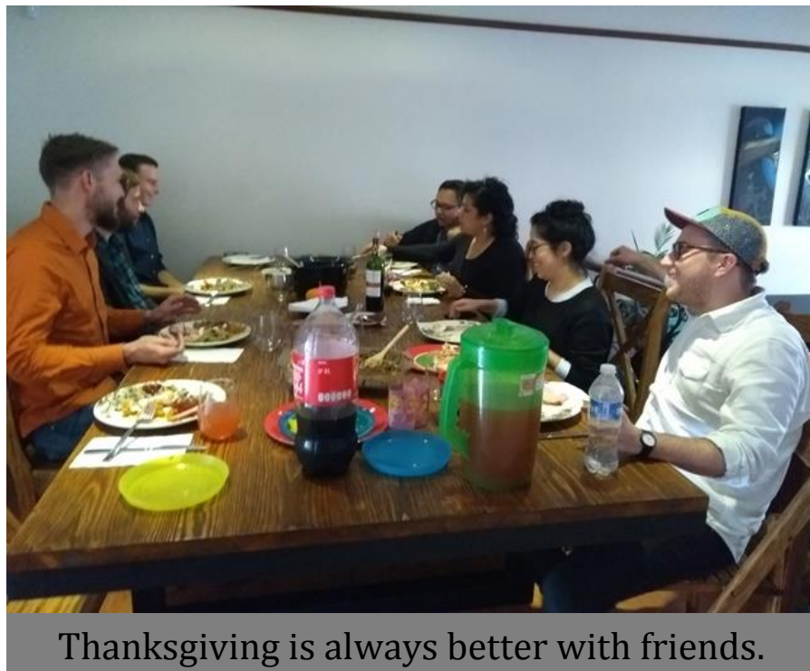
Thanksgiving is always better with friends.